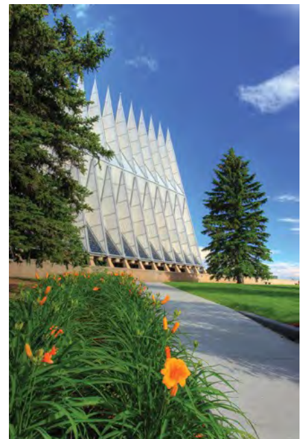
Air Force Academy Exterior

A typical conference week consists of classes, tours, programs, lectures, workshops, evening receptions, and finally culminating with the PSA Honors Banquet on Saturday evening. From Sunday through Tuesday afternoon, you may participate in the "pay for" classes and or any of the eleven tours. The classes and tours are explained further