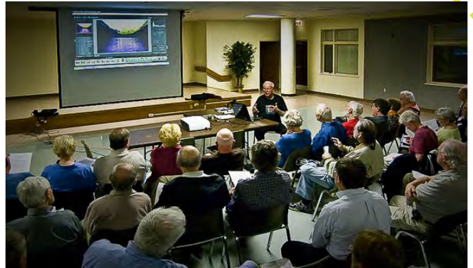
The Delaware Photographic Society has an Adobe Lightroom 3 Club Event on May 2.

Three items the demonstrator/presenter receives: