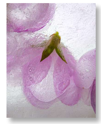
Mallow Blossoms Under Ice Margret Cordts