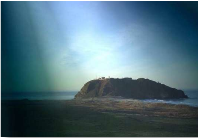
Big Sur LH-2