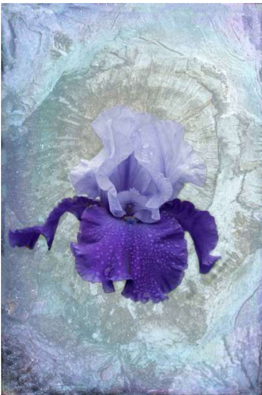
Iris on Wood

Comment: The idea is strong and the subtlety is definitely there - the visual balance would benefit from some drama in the lighting --- creating more dimension would fit better with the title --- the two images feel too ---pasted--- rather than blended