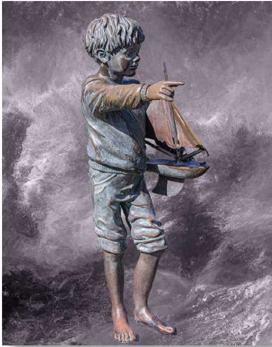
Little Sailor at Lovers Point