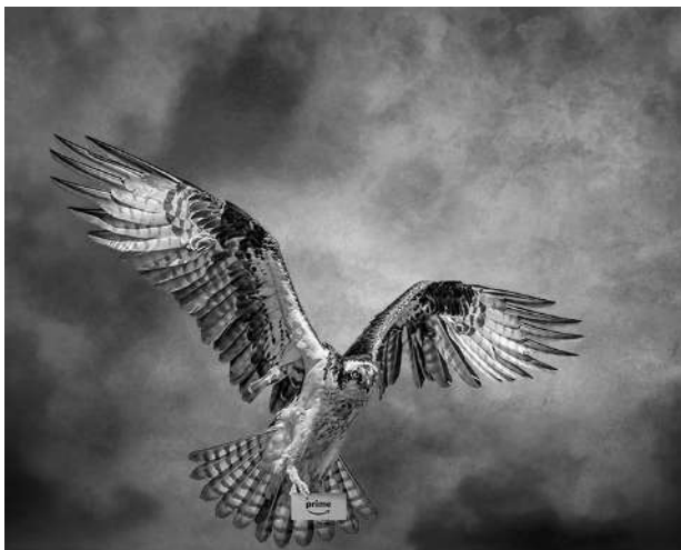
Amazon Prime Delivery