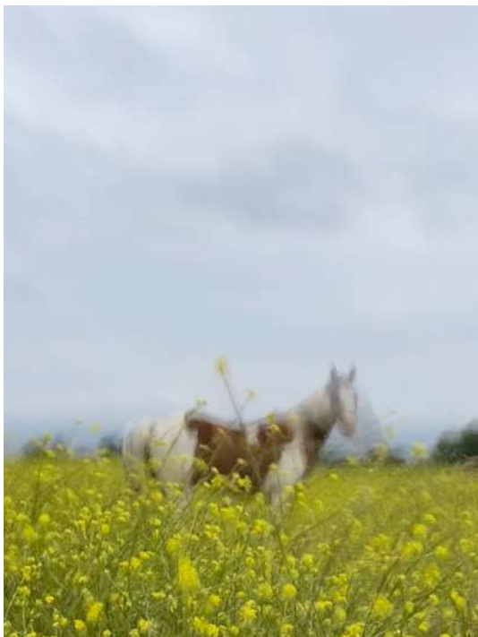
Outstanding in its Field

Comment: Very nicely done - excellent concept and execution --- the color and tonal balance is what makes this image work --- the ---light--- within the frame makes sense as far as brightness and direction - small change, bring down the bright spot in the upper right corner - it is out of balance and distracting --- there are a few stray blue dots near the moons --- planets??