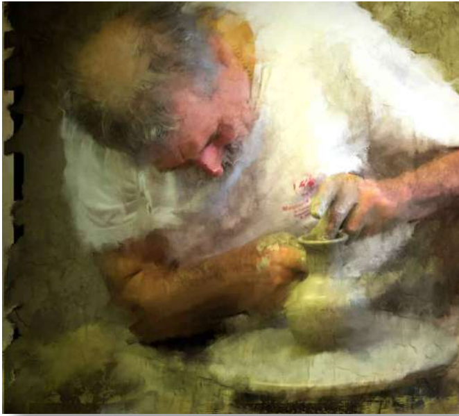
Potter in Italy