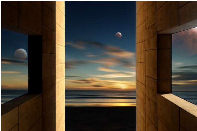
Moons at the Window

Comment: The lighting really brings out the color and dimension-the bronze and patina really sing --- the background creates a mysterious ---wave to work with the young sailor --- a little feathering of the edge of the sailor will connect the subject to the background to soften the cut and pasted feeling