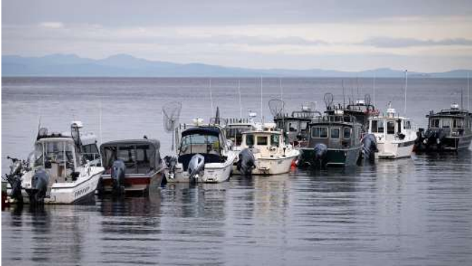
Strait of Juan de Fuca Bill Brown STAR RATING:4

If you rotate the image CW 1 angle I think you'll find it not so skewed feeling. The colors, contrasts and subject give wonderful movement to the marinescape.