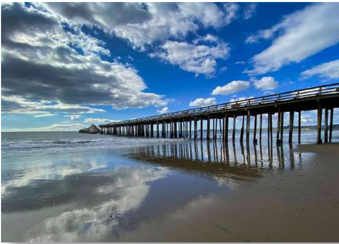
Seacliff State Beach Carol Silveira STAR RATING:2

If you rotate the image CW 1 angle I think you'll find it not so skewed feeling. The colors, contrasts and subject give wonderful movement to the marinescape.