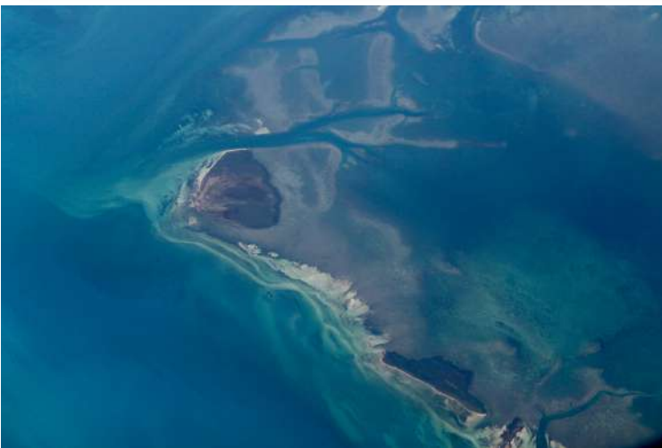
Eight Miles Over Cuba Kent Van Vuren