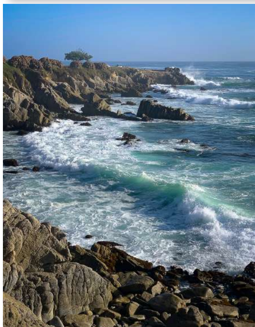
Coastline Patterns of Rocks and Waves Margret Cordts STAR RATING:4

Absolutely beautiful! perfect composition.