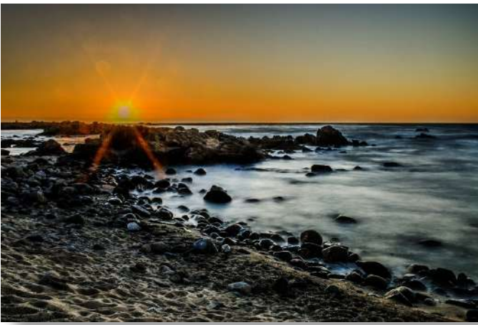
Sunset over Rocks and Sand