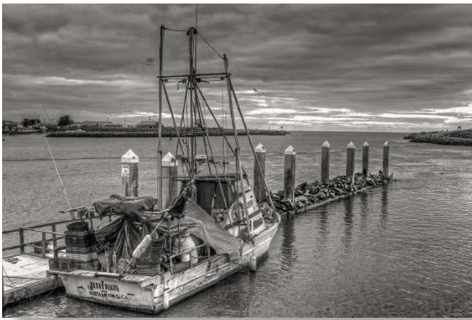
Jefferson Carol Silveira STAR RATING:4

The black and white makes this image work very well. composition is good, the pilings, reflections, and dramatic sky are wonderful.