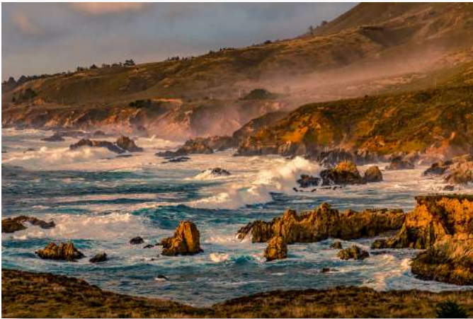
Garrapata Rocks Rick Verbanec STAR RATING:3

Beautiful shot- nice shapes of the rigging and boat contrasted with the clouds and smooth patterned water.