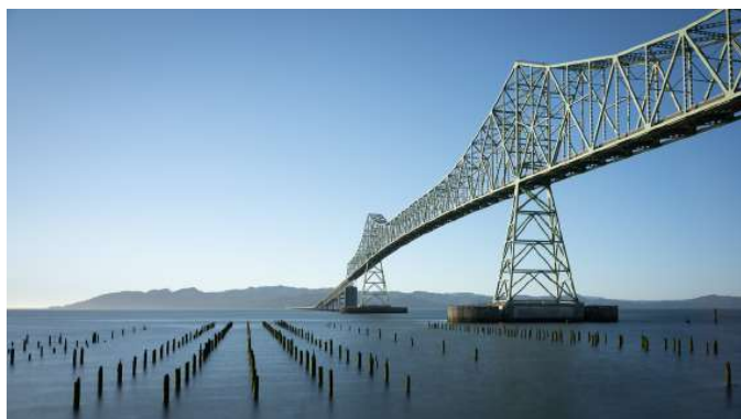
Astoria-Megler Bridge Bill Brown STAR RATING:5

All submitted images - winners appear at the end.