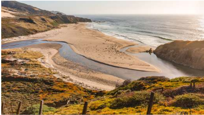
Little Sur Rivermouth Rick Verbanec STAR RATING:3

The black and white makes this image work very well. composition is good, the pilings, reflections, and dramatic sky are wonderful.