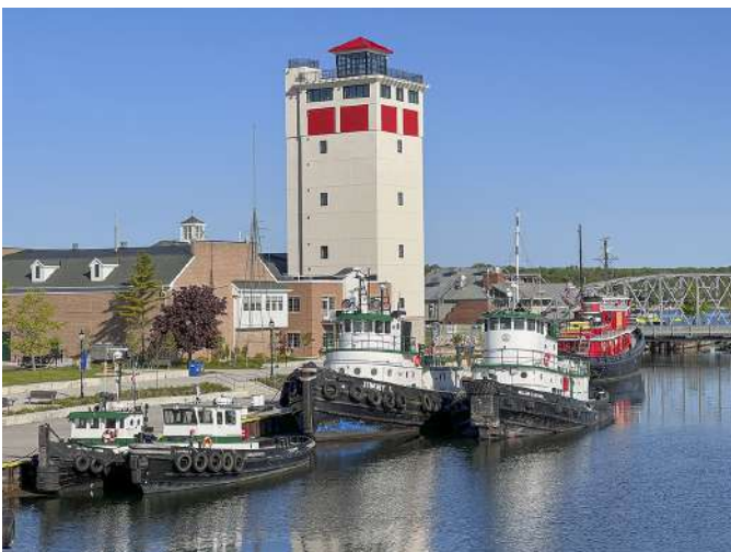
Sturgeon Bay Waterfront and Maritime Museum Bill Shewchuk STAR RATING:2

Simple composition works, artistically-might have wanted the reflections in the water to be more of the story.