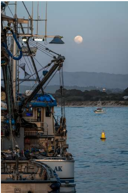
Moonrise over Fishing Boat Chris Johnson STAR RATING:4

Definitely captures a marinescape. Composition works with the interesting shapes of the sand bars and waterways, fence posts framing in the bottom edge- nice touch.