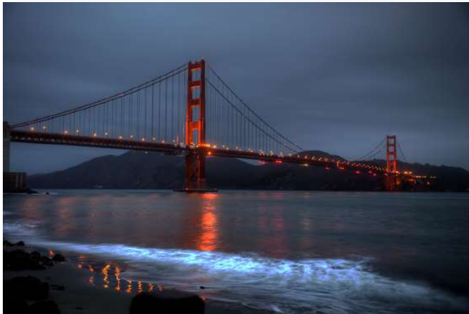
Golden Gate Bridge at Dusk Brian Spiegel STAR RATING:5

Nice capture of rocks and breaking waves! Try cropping top 1/4 of image for more balance in composition.