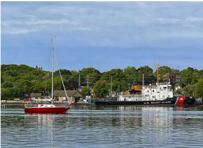
Sturgeon Bay Canal Bill Shewchuk STAR RATING:2

Wonderful parade of boats- alternating lights and darks add to the balanced composition. Faceted patterned boats vs tranquille water and skies- nice!