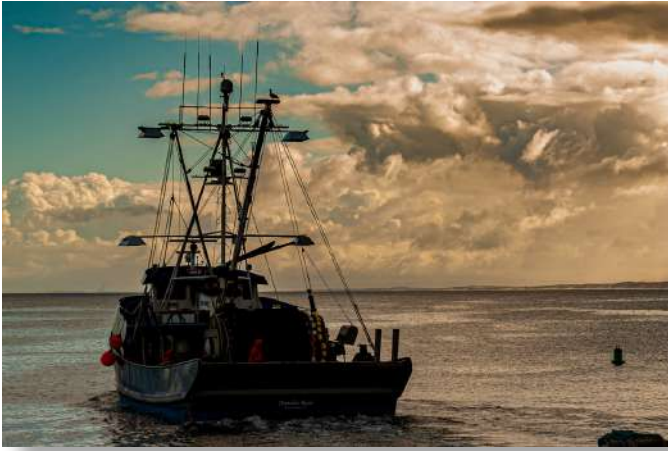
Fishing Boat Leaving Monterey Wharf Dennis Giuffre STAR RATING:4

Beautiful shot- nice shapes of the rigging and boat contrasted with the clouds and smooth patterned water.