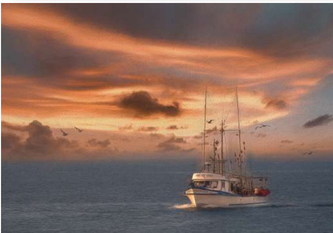
Homeward Bound Julie Chen STAR RATING:3

Gorgeous photo! Composition, color, contrast, mood- wonderful!