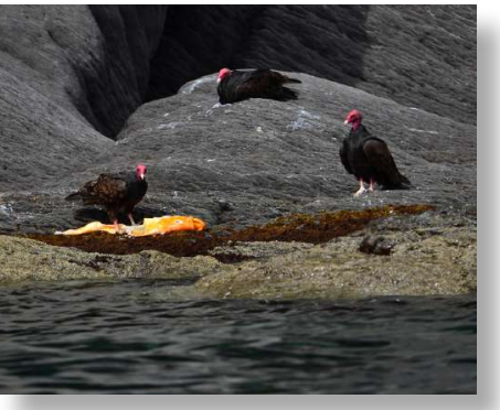
Vultures and a Fish on the Water's Edge Carol Fuessenich